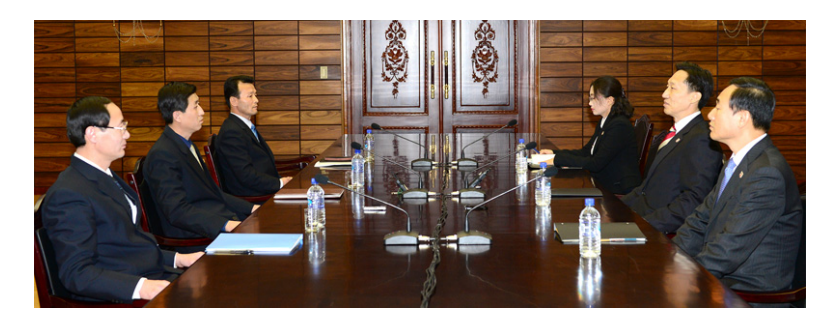
Inter-Korean Red Cross Working-Level Meeting (Feb. 5, 2014)