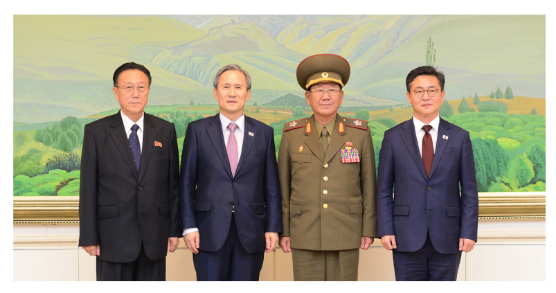
Inter-Korean High-Level Authorities' Meeting (Aug. 22~24, 2015)

The two Koreas also agreed to hold a reunion for separated families on the occasion of Chuseok and activate non-governmental exchanges in various areas.