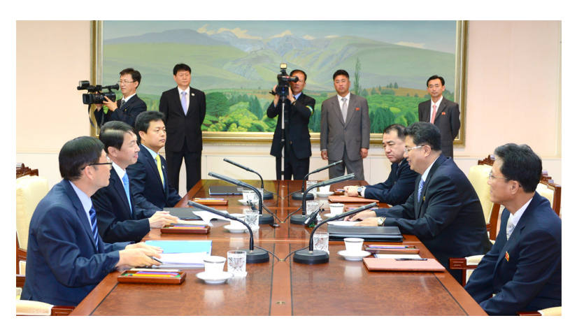
Inter-Korean Working-Level Meeting for the Incheon Asian Games (Jul. 17, 2014)

Although no agreement was reached at the meeting, on August 19, North Korea dispatched its delegation to the drawing ceremony of the Incheon Asian Games (August 21) and suggested discussing the North Korean team's participation via documents. South Korea accepted this suggestion. Later, both sides discussed the participation of the North Korean team through the liaison channel at Panmunjeom. They agreed on the size of the team, the access routes, and the need for the team to be well-accommodated. Accordingly, its participation in the Incheon Asian Games was settled