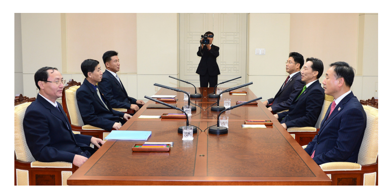
Inter-Korean Red Cross Working-Level Meeting (Sep. 7~8, 2015)

Besides holding the reunion for separated families, the two Koreas also agreed to find fundamental solutions for humanitarian issues. The South and North agreed to hold inter-Korean Red Cross talks in the near future to broadly discuss mutual interests.