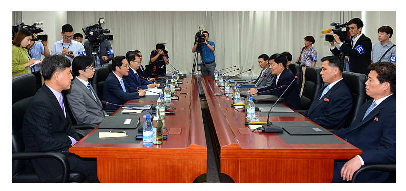
The 5<sup>th</sup> Joint Committee Meeting for the GIC (Jun. 26, 2014)

At the two meetings between the co-chairs of the joint committee from both South and North, North Korea maintained its stance. The Fifth Meeting thus ended without agreement. Both sides agreed to set future dates for the South-North Joint Committee and Subcommittee meetings through the Secretariat of the South-North Joint Committee for the GIC.