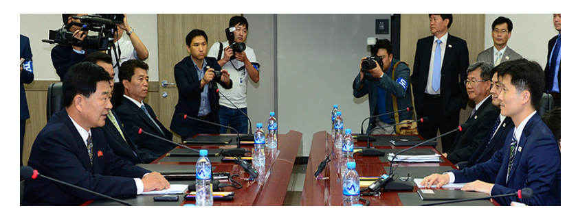
The 6<sup>th</sup> Joint Committee Meeting for the GIC (Jul. 16, 2015)