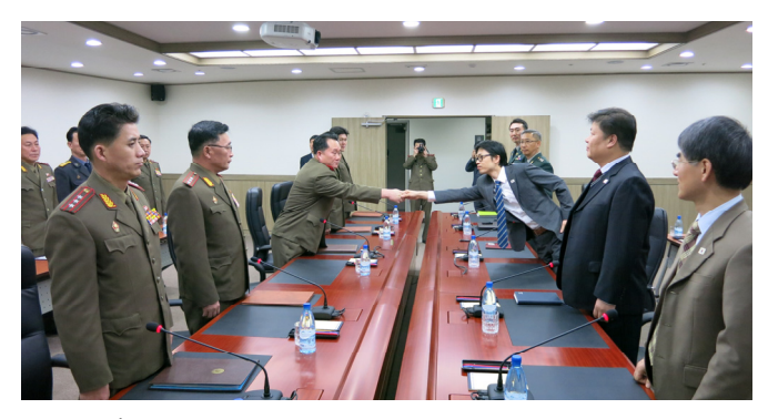
The 4<sup>th</sup> Meeting of the Joint Subcommittee for the 3Cs (Jan. 24, 2014)

After the plenary meeting, South and North Korea discussed the details through sectoral meetings and co-chair meetings. Both sides agreed to practice unrestricted daily passage commencing January 28 immediately after a technical inspection, and to continue discussing the communications issue through subsequent working-level discussions on February 7.