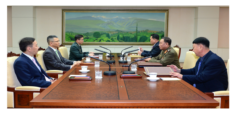
Inter-Korean Military Authorities' Meeting (Oct. 15, 2014)

The two sides having failed to narrow the gap in their positions, the meeting ended without any agreement.