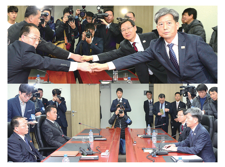
The 1<sup>st</sup> Inter-Korean Vice-Ministerial Level Talks (Dec. 11~12, 2015)

However, the North did not respond to South Korea's proposal for an inter-Korean working-level talk, adhering to its stance that other matters, including the separated families issue, could not be discussed until the issue of the resumption of Mt. Geumgang tourism was resolved.