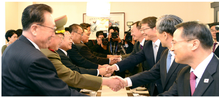
Inter-Korean High-Level Talks on the Occasion of the Closing Ceremony of the Incheon Asian Games (Oct. 4, 2014)