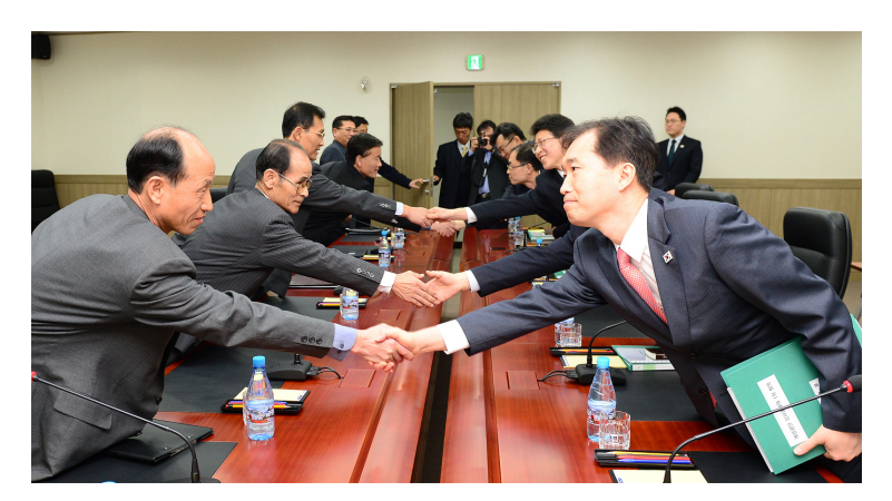
The 1<sup>st</sup> Meeting for the Operation of the Commercial Arbitration Commission (Mar. 13, 2014)