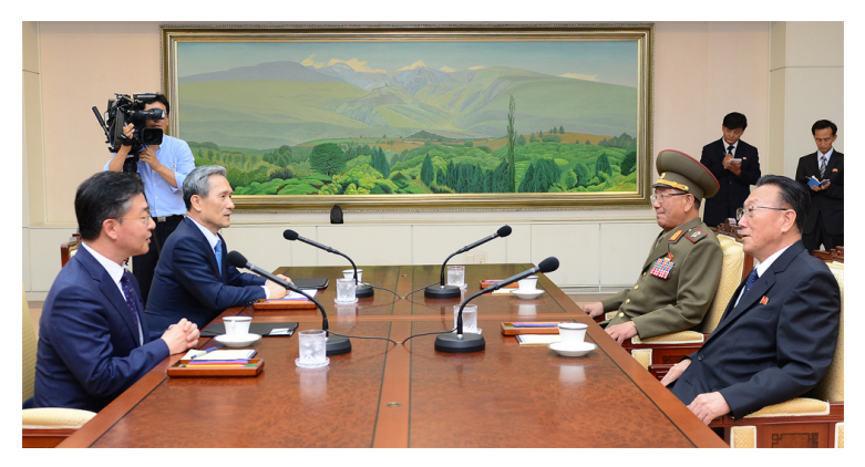
Inter-Korean High-Level Authorities' Meeting (Aug. 22~24, 2015)

Having begun as scheduled at 6 pm on August 22, the meeting continued until the morning of August 23. In the afternoon of that day, the two sides agreed to have a subsequent discussion and adjourned the first meeting.